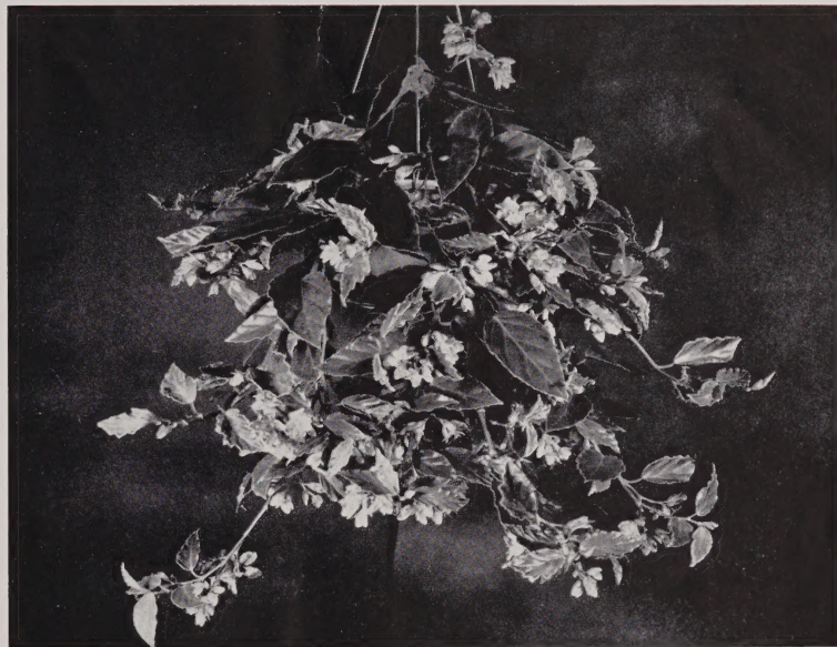
Glaucophylla Splendens (Fibrous Rooted Hanging Begonia)

Tubers . . . If early flowering is desired, place tubers in flats with moistened peat and leaf mold (half and half) during January and February. Keep uniformly moist but not too wet in a warm place well lighted until three or four inches of growth develop, then plant in pots or shady position in open if desired. In autumn when the foliage turns yellow, withdraw water gradually and when all growth dies down entirely, take out tuber, wash off soil, dry in sunlight until thoroughly dry, then store in cool, dry place until time to plant again.